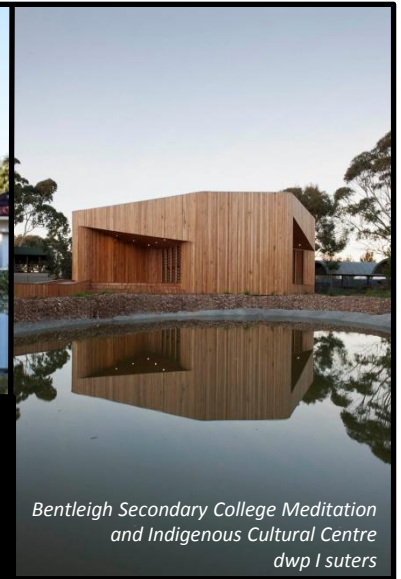
Bentleigh Secondary College Meditation and Indigenous Cultural Centre dwp | suters