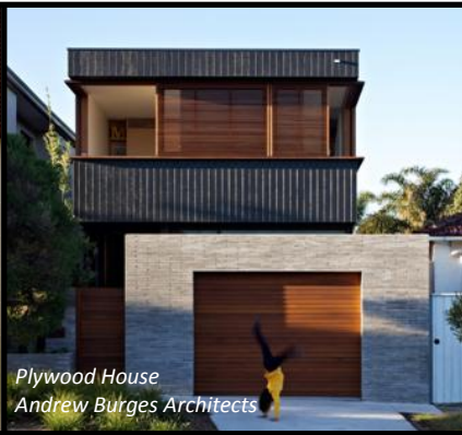
Plywood House Andrew Burges Architects