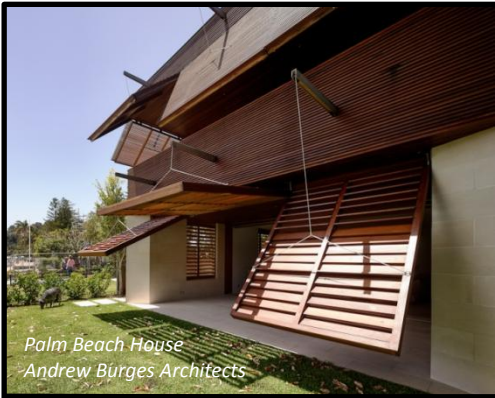
Palm Beach House Andrew Burges Architects